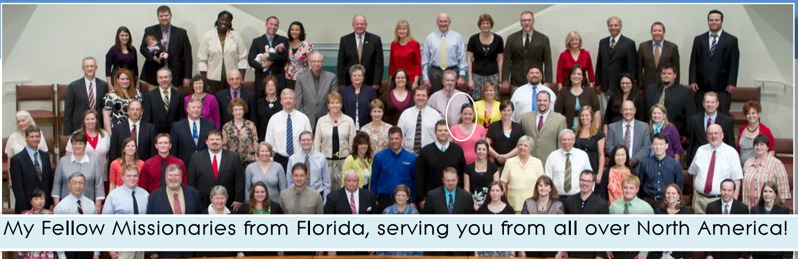
My Fellow Missionaries from Florida, serving you from all over North America!

Thank you all for your encouragement and prayers! Together I know we can impact students' lives for Christ!